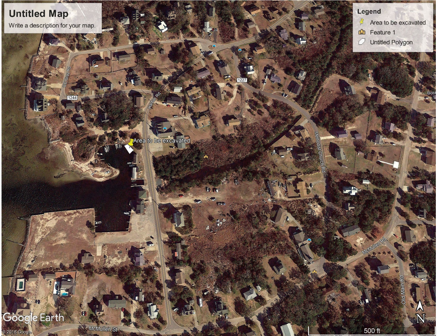
Figure 2. Project Location Map.